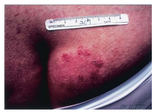
Fig 2. Eighty percent clearing of a buttock plaque. This patient was a 22-year-old woman. Initial severity scores for the plaque were 2 for erythema, 2 for thickness, and 2 for scale ( left ). After 10 treatments, there was 80% clearing with final severity scores of 1 for erythema, 0 for thickness, and 1 for scale ( right ).

only 6.8% dropped out of the study because of dissatisfaction with their progress.